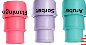
Stacking Canister Set

Aruba, Sorbet or Flamingo Capacity: 2 cups 4 cups, 6 cups $19 value Sale $17