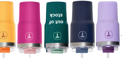
Eco+ AquaVibe™ Bottle Keep track of your daily water intake! Nocturnal Sea/Navy or Aquamarine Blue 1.2 L $13 2L $16