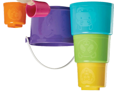
Tupperware® Impressions 9-piece Mini Set

Playdate Pack Set includes: four 6-oz Bell Tumblers & Sipper Seal ® , four 8-oz. Ideal Ltl ® Bowls, and one Shape-O ® Toy $88 Value. Sale $44