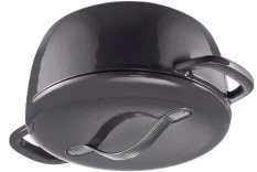
Cast Iron Cocotte Includes one Enamelled Cast Iron 5 1/2-quart Cocotte $376 value, Sale $99

Amazing Series Knives Japanese Stainless Steel: Well-known to be lightweight, precise, and really sharp • Protective Knife Sheath: Safeguards fingers, preserves blade sharpness, and lets knife travel safely for picnics and birthday cakes • Smart Lock Sheath: Each knife features a notch on its handle to securely lock the sheath to the knife, which allows you to safely hang your knives and guarantees that the sheath will always remain in place. • Color Coded: Colors are matched between sheath and knife to quickly identify where each belongs. A. Chef Knife $22 B. Bread Knife $19