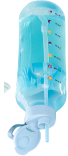
Eco+ AquaVibe™ Bottle 2L Keep track of your daily water intake! Icelandic Mist Value $16, Sale $12