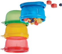
Ideal Little Bowls

skills, teach cause and effect, increase self-esteem, and help with shape identification and color practice. Includes one Shape-O® ball and 10 shaped blocks.