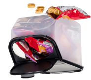
Access Mate Medium

Front-loading access: An easy-open, stay-up lid on the front of the container makes it a snap to use and refill. Stackable & modular: Designed to stack securely Perfect for snacks, pet treats, small toys and more 3 qt. W 7.2 X H 7.3 x L 10.7 in. $37 value Sale $21