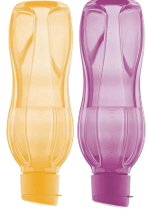
LARGE BOTTLE 36 OZ./1L Amethyst or gold $10 each