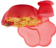
Chip 'N Dip Set

Includes: rectangular container, seal, and 3 trays that each hold 8 eggs (24 total) W9" x H 2.5" x L 12" Value $44. Sale $28