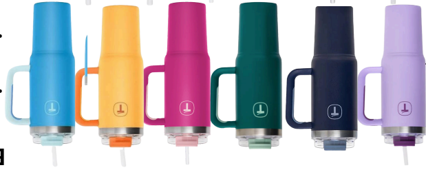
Tupperware® Big T Tumbler® 37oz $39