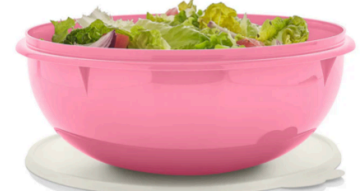
Fix 'n Mix Bowl Perfect for kneading bread dough, mixing batter, or putting together a salad for a potluck crowd. 27¼ cup capacity. Soft Candy bowl $35