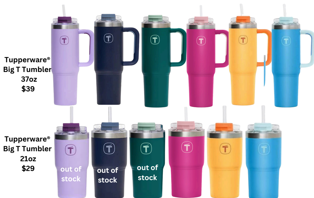
Tupperware® Big T Tumbler 37oz $39