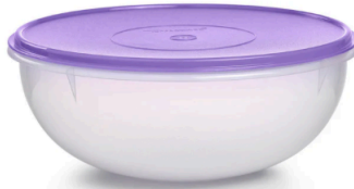
Fix 'n Mix Bowl Perfect for kneading bread dough, mixing batter, or putting together a salad for a potluck crowd. 27¼ cup capacity. Sorbet seal $35