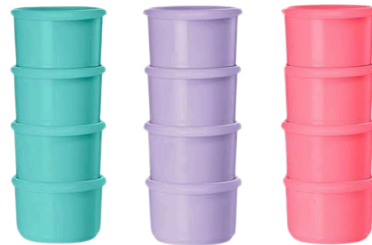
4pc Canister Set Choice of 3 colors Aruba, Sorbet or Flamingo Capacity 2 cups. H 3.2 x Ø 5.1 in $20 value Sale $17