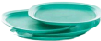
Microwave Reheatable* Luncheon Plates LIMITED RELEASE COLORS W 9.5 x L 9.5 inch Set of four $31 Value. Sale $21 Set of eight. $62 value. Sale $31