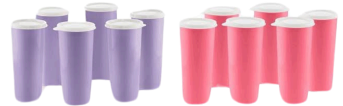
16oz Tumblers Choice of two colors Sorbet or Flamingo $27 value. Sale $17