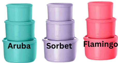
Stacking Canister Set Choice of 3 colors Aruba, Sorbet or Flamingo Capacity: 2 cups 4 cups, 6 cups $19 value Sale $17