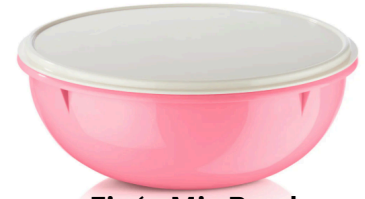
Fix 'n Mix Bowl Perfect for kneading bread dough, mixing batter, or putting together a salad for a potluck crowd. 27¼ cup capacity. Soft Candy bowl $35