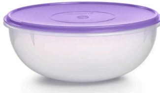
Fix 'n Mix Bowl Perfect for kneading bread dough, mixing batter, or putting together a salad for a potluck crowd. 27¼ cup capacity. Sorbet seal $35