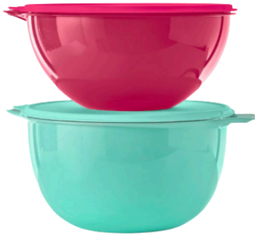
Thatsa® Bowl Thatsa & Mega Includes one each: 32-cup and 42-cup bowls with seals. $65 Value Sale $39