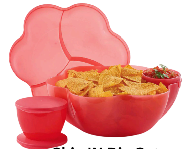
Chip 'N Dip Set Chips 'n salsa, Salad bar, Punchbowl and more. Cover serves as a serving tray. 16oz. 1.5 gallon microwave-safe dip bowls. Raspberry. $54 Value Sale $25