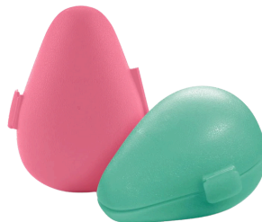
Avocado Keeper Keep your avocados fresh once you cut them! Set of two. $20 Value Sale $10