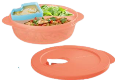
E. CrystalWave® PLUS Lunch 'N Dish with Cold Cup Includes 3¼ -cup container with 1-cup removable cup. $20