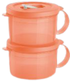
A. CrystalWave® PLUS Soup Mugs 2 cup capacity $22 value. SALE $11 Save 50%