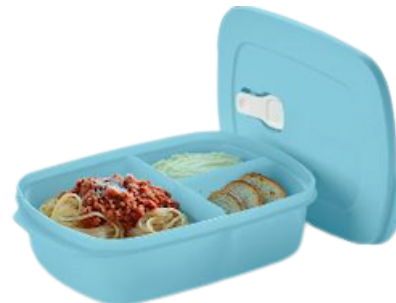
D. CrystalWave® PLUS Rectangular Divided Dish 4 cup divided dish $17