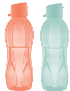
SMALL BOTTLE Choice of Cozy Rosy or Aquamarine 16 OZ. $6 ea