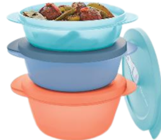
B. CrystalWave® PLUS Round Set Includes one 1½-cup, one 2½-cup, and one 3-cup round container. $37