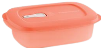
C. CrystalWave® PLUS 4-cup Rectangular $15