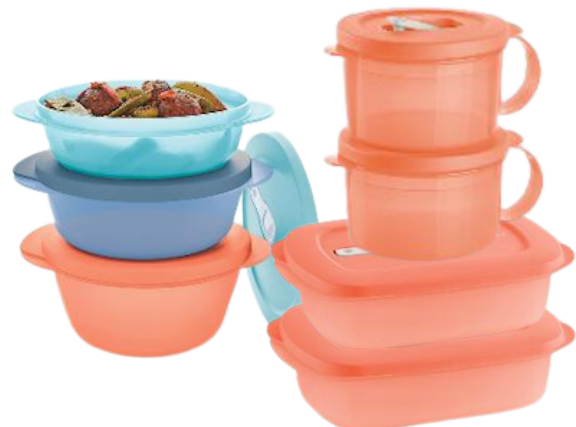
CrystalWave® PLUS Super Set Items A, B. and two of C SALE $69