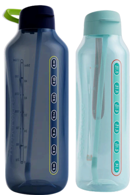
Eco+ AquaVibe™ Bottle Keep track of your daily water intake! Nocturnal Sea (2L only) Aquamarine Blue 2L $16 1.2 L $13.