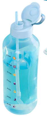
Eco+ AquaVibe™ Bottle 2L Keep track of your daily water intake! Icelandic Mist Value $16. Sale $10