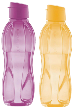
LARGE BOTTLE 36 OZ./1L Amethyst or gold $10 each