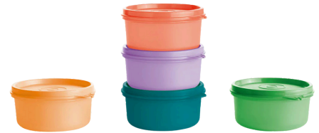
C. Serving Bowls Includes five 6-oz./190 mL bowls with liquid-tight seals. $15