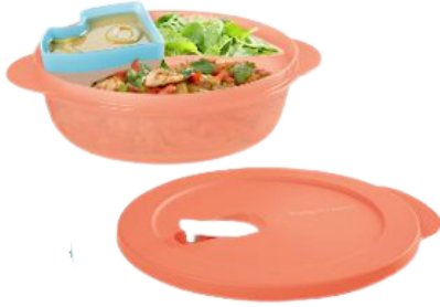
CrystalWave® PLUS Lunch 'N Dish with Cold Cup Includes 3¼ -cup container with 1-cup removable cup. $20