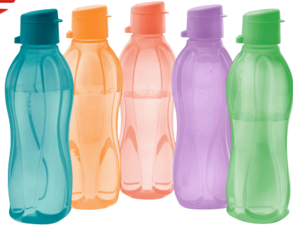
A. Small Eco Water Bottles Includes five 16-oz./500 mL bottles with flip-top lids. $30