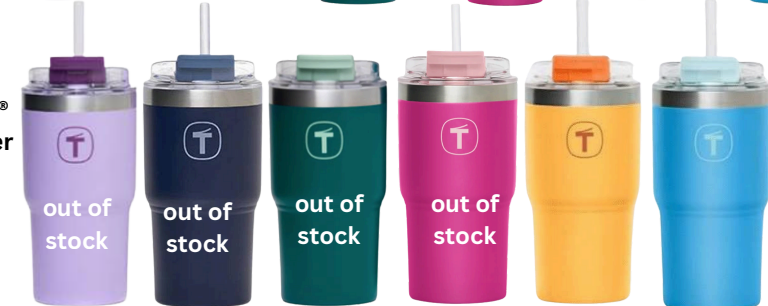
Tupperware® Big T Tumbler 21oz $29