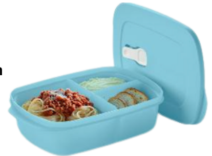
CrystalWave® PLUS Rectangular Divided Dish 4 cup divided dish $17