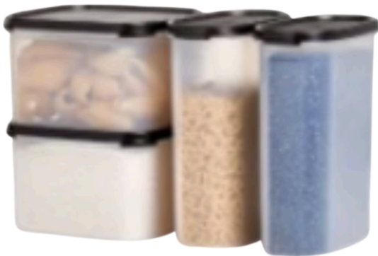
Modular Mates® | Set of 4 Set includes two each 9 3/4-cup/2.3L Oval 4 and 11-cup/2.6 L Square 2 containers with seals. $70 value SALE $60