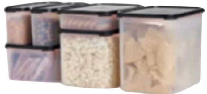
Modular Mates® | Snack Center Set includes two 7 1/2-cup Super Oval 2 containers with seals, and one each of the following containers with seals: • 8 1/2-cup/2L Rectangular 1 • 18-cup/4.3L Rectangular 2 • 27 1/2-cup/6.5L Rectangular 3 • 37-cup/8.7L Rectangular 4 $122 Value SALE $98