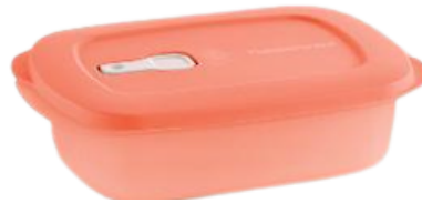
CrystalWave® PLUS 4-cup Rectangular $15