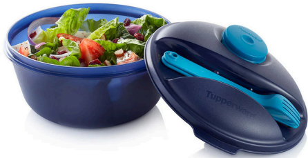
Salad On the Go Set Includes one 6½-cup round bowl with cutlery-holder seal, one 2oz. Tupper® Mini container, and one snap-together fork & knife $22 value. SALE $16