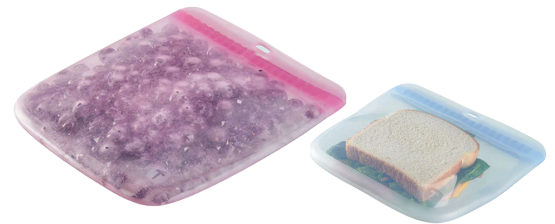
Ultimate Silicone Slim Bags Eliminate single use bags with our reusable slim bags 1-Qt $12. 1 ¾ qt $16