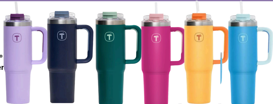
Tupperware® Big T Tumbler 37oz $39