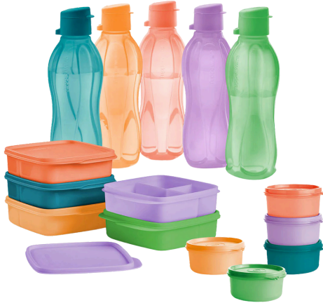
Must Have Deal Includes A-C. $95 value Sale $69