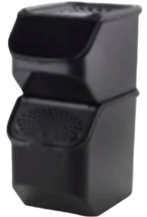
Smart Container Set Includes Potato Smart® Container: 5 Qts. and Onion & Garlic Smart® Container: 3 Qts. $76 Value SALE $70