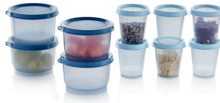
Super Snack 10-Pc. Set Set includes a set of six 2- oz./60mL Tupper® Minis and a set of four 4-oz./120mL Snack Cup containers with leak proof seals. $27 value. SALE $20