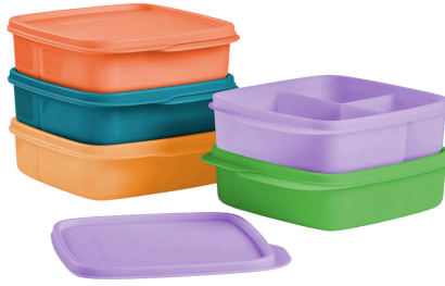
B. Lunch-It Containers Includes five containers with lids, each with one 1 1/3-cup and two 1/3-cup separated compartments. $50