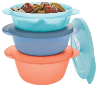
CrystalWave® PLUS Round Set Includes one 1½-cup, one 2½-cup, and one 3- cup round container. $37