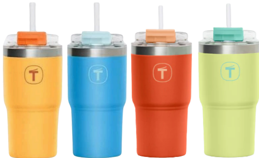
Tupperware® Big T Tumbler 21oz $29