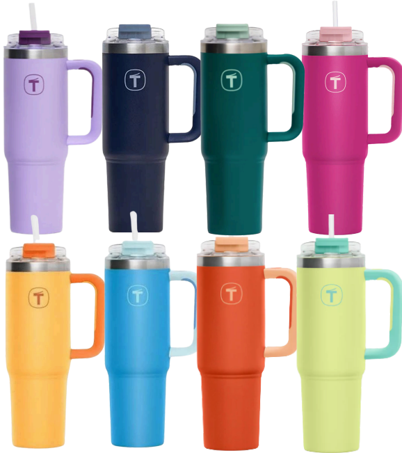
Tupperware® Big T Tumbler 37oz $39