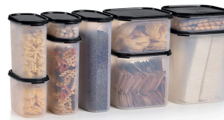
Modular Mates® Oval & Square Set

Set includes one each of the following containers with plain seals: