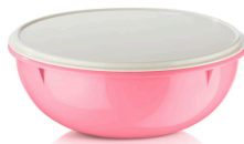
Fix 'n Mix Bowl

Perfect for kneading bread dough, mixing batter, or putting together a salad for a potluck crowd. 27¼ cup capacity. Sorbet seal $35