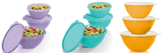
Classic Wonderlier® Set | 3pc Set

The original and best-selling Tupperware® bowls have been a favorite for more than 70 years! You'll soon see why these nesting bowls with airtight seals are a cook's best friend, allowing you to prep, serve, store, and transport in one 3-piece set. Includes 3 bowls. 1 each: 2 cups, 3¾ cups, 4½ cups with leakproof seals. $24