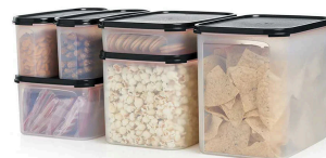
Modular Mates® 6pc Set

2-cup Oval 1, 4¾-cup Oval 2, 7¼-cup Oval 3, 9¾-cup Oval 4, 12¼-cup Oval 5, 5-cup Square 1, 11-cup Square 2, 16¾-cup Square 3, 23-cup Square 4. $139