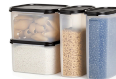
Modular Mates® 4pc Set

3½-cup Super Oval 1, 7½-cup Super Oval 2, 11¼-cup Super Oval 3, 16½-cup Super Oval 4, 20¾-cup Super Oval 5, 8½-cup Rectangular 1, 18-cup Rectangular 2, 27½-cup Rectangular 3, 37-cup Rectangular 4. $179 Value SALE $169