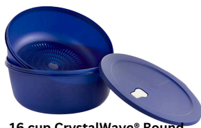
16 cup CrystalWave® Round with Colander

Drain, soak, or defrost in position one; season, marinate, or rehydrate in position two. Fits inside Thatsa® Medium Bowl. $13 Value Sale $9