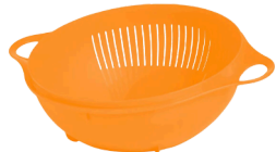
Thatsa® Bowl Colander

Perfect for kneading bread dough, mixing batter, or putting together a salad for a potluck crowd. 27¼ cup capacity. $35