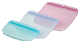
Ultimate Silicone Slim Bag Set