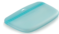
Ultimate Silicone Slim Bag Mini

Only $4 US/$6 CA with any order of $100 US/$120 CA or more!