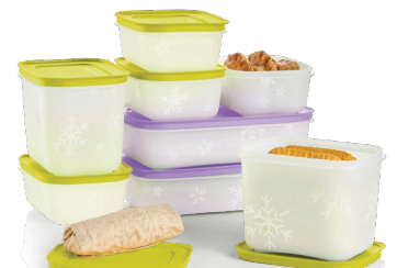
Freezer Mates ® PLUS Starter Set