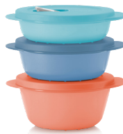
Crystalwave ® PLUS Round Set