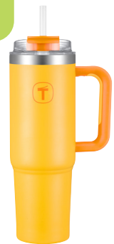
Tupperware ® big T Tumbler 37 oz / 1.1 L