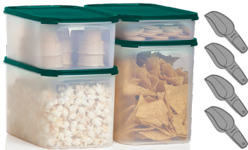
Modular Mates ® Rectangular Set