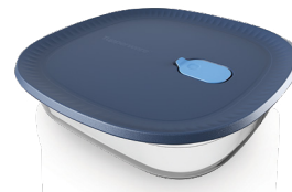
Tupperware Voila™ Glass Square Bakeware