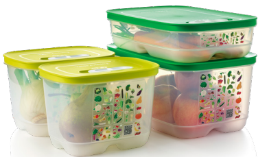
FridgeSmart ® 4-Pc. Starter Set

Limited-time savings on all colors and sizes. Excludes Dewberry color.